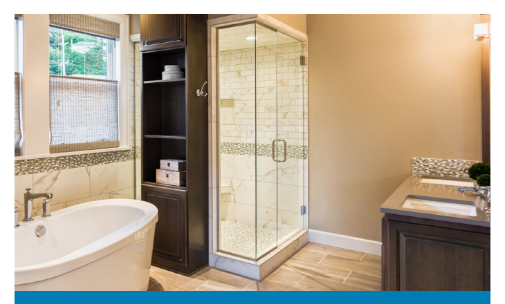
"XactRemodel saves so much more time over having to write down all the materials and pricing those materials out with the store."

"When we are generally quoting jobs, it is a lot easier to use XactRemodel over any other program," Skip said. "We're seeing a 30 percent time savings at a minimum."