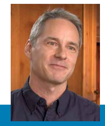
"When we are generally quoting jobs, it is a lot easier to use XactRemodel over any other program. We're seeing a 30 percent time savings at a minimum."

RAR Contracting learned about Xactware from several other contractors participating in the HRS program and decided to research the solution further. RAR Contracting soon concluded that one of its products, XactRemodel, filled its needs for a versatile estimating solution.